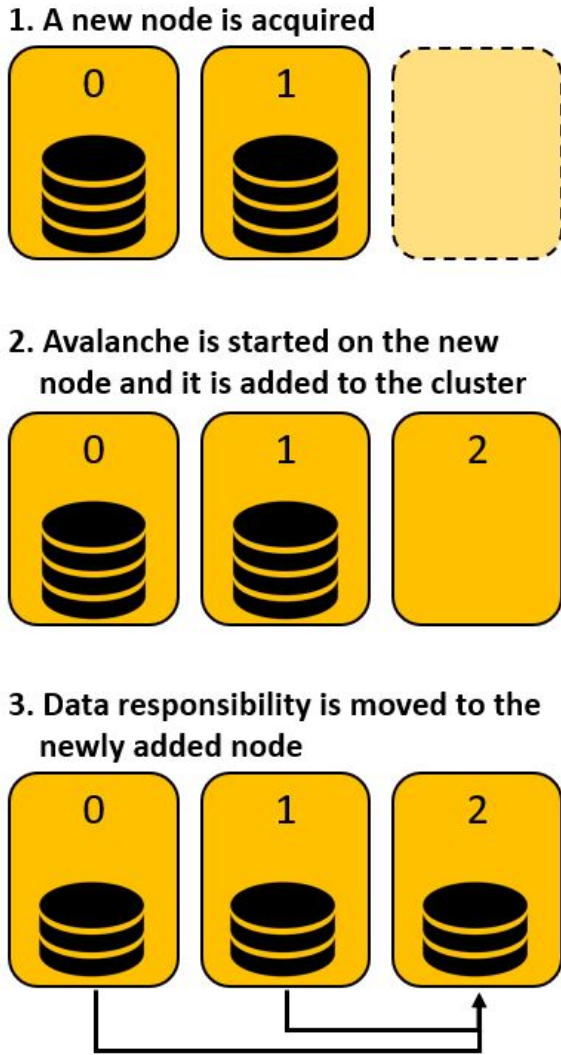
Figure 1: Scaling process for adding nodes

The scaling process does currently not support concurrent user sessions in the system, which especially makes it unable to serve read or update transactions during the scaling process. Therefore, all user sessions have to be finished before starting the scaling process.