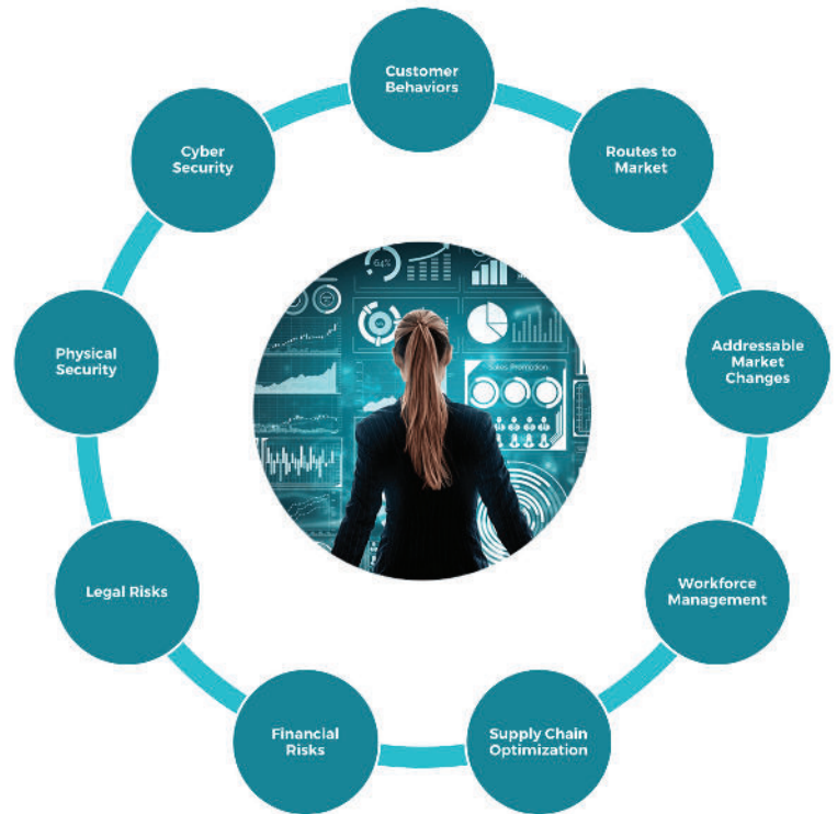
Figure 2. Key Areas of Business Headwinds Addressed During Periods of Market Uncertainty

Actian Avalanche delivers superior price-performance cloud data warehouse on the market as compared to alternative solutions in the market today. It runs on commodity hardware with patented technology to extract the most performance possible in the cloud or on-premise. Additionally, as a Real-Time Connected Data Warehouse it offers over 200 pre-built, extensible connectors and templates to popular SaaS and on-premise applications so that you can bypass the intricate ETL process and quickly move data into Avalanche. It uses a proven integration technology that provides data cleansing, data enrichment, deduplication, and other transformations beyond just data ingestion. Finally, it bundles in streaming data capabilities based on Spark and Kafka standards to ensure real-time ingestion is paired with real-time analytics performance.