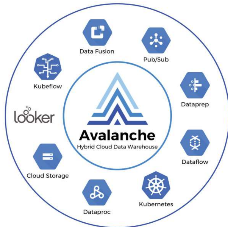
Figure 1. Avalanche is integrating with Google Cloud ecosystem to make the user experience seamless.

Actian Avalanche Cloud Data Platform leverages Google Cloud’s scalable infrastructure and global network to deliver breakthrough performance, concurrency and cost savings for data-driven enterprises. Avalanche features native integration with Google Cloud’s Looker business intelligence and analytics platform, and hundreds of popular SaaS and enterprise applications, to provide a comprehensive solution that is easy to deploy and consume.