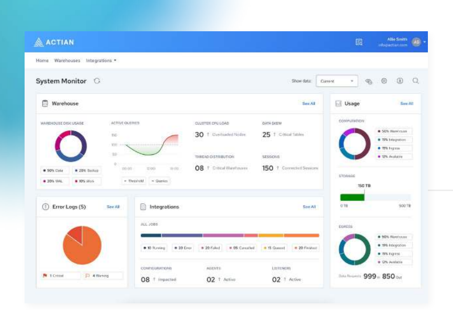
Figure 1: Unified View of Operations

Monitor integration and warehouse operations in a single, unified view